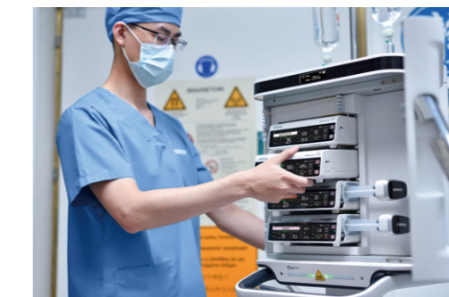
Free combination of four channels